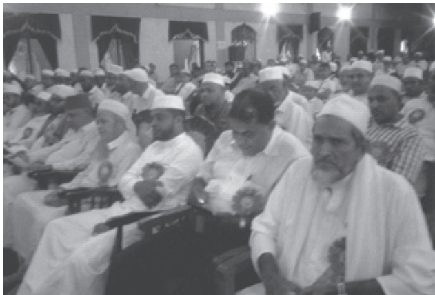
Meelad Celebrations at Hizbulla Hall, Kattankudy