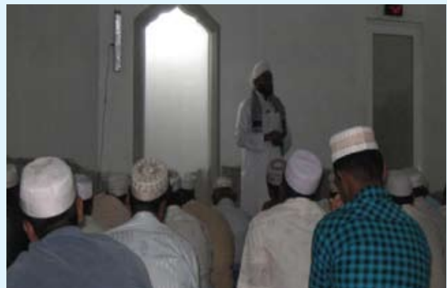
Zaviya Mosque, Kattankudy