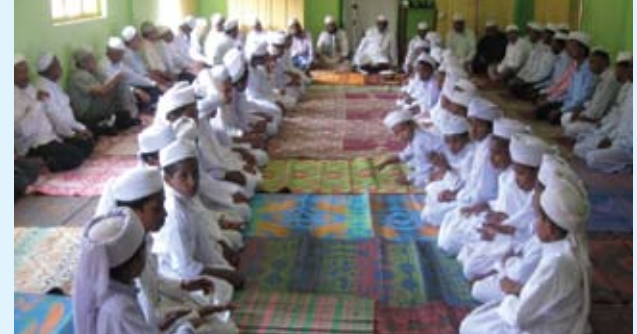
Shazuliya Madrasa in Eravur