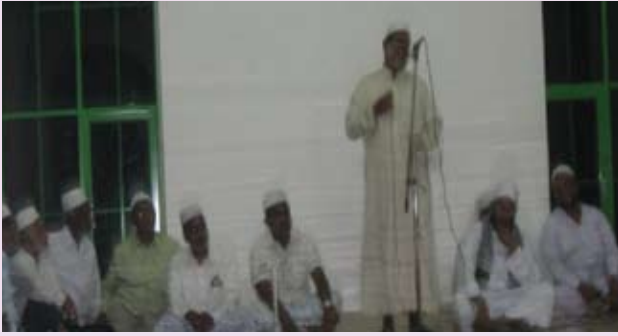
Masjidul Rasool, Aryampathy, Kattankudy

A special program was arranged at the Masjidul Rasool Mosque in Aryampathy, Kattankudy. The Chairman and Vice Chairman of the Urban Council received the delegation. Majlis, Halara and Musaakara were conducted with the participation of the residents of the Iran Housing Scheme in the area.