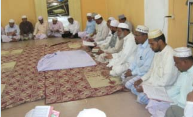
Haddaad Rathib being recited at Jiffriya Thackckiya, Eravur